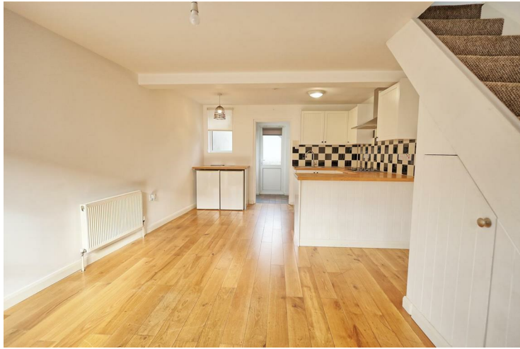
LIVING AREA 19'8 x 12 (5.99m x 3.66m)