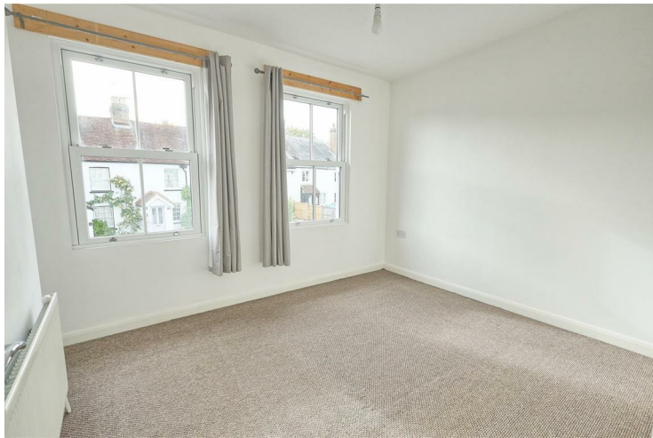
BEDROOM ONE 10'4 x 8'10 (3.15m x 2.69m)